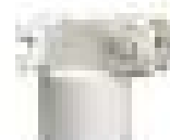
Wall Bracket / Conduit Mount