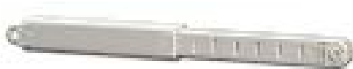
20 cm Telescoping Extension Rod